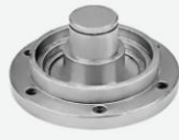
ROTOR PIN SIDE PANEL