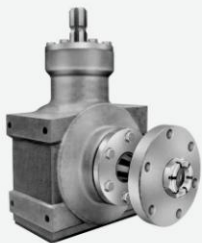
GEAR BOX POST HOLE DRIGAR