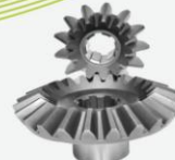
13 X 23 CROWN PINION