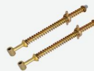
DAMPER SPRING ASSY.