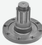
R D SHAFT