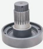
GNL ROTOR HUB