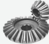
13 X 25 CROWN PINION