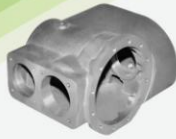
GEAR BOX 1000RPM-SEMI