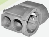
GEAR BOX 1000RPM